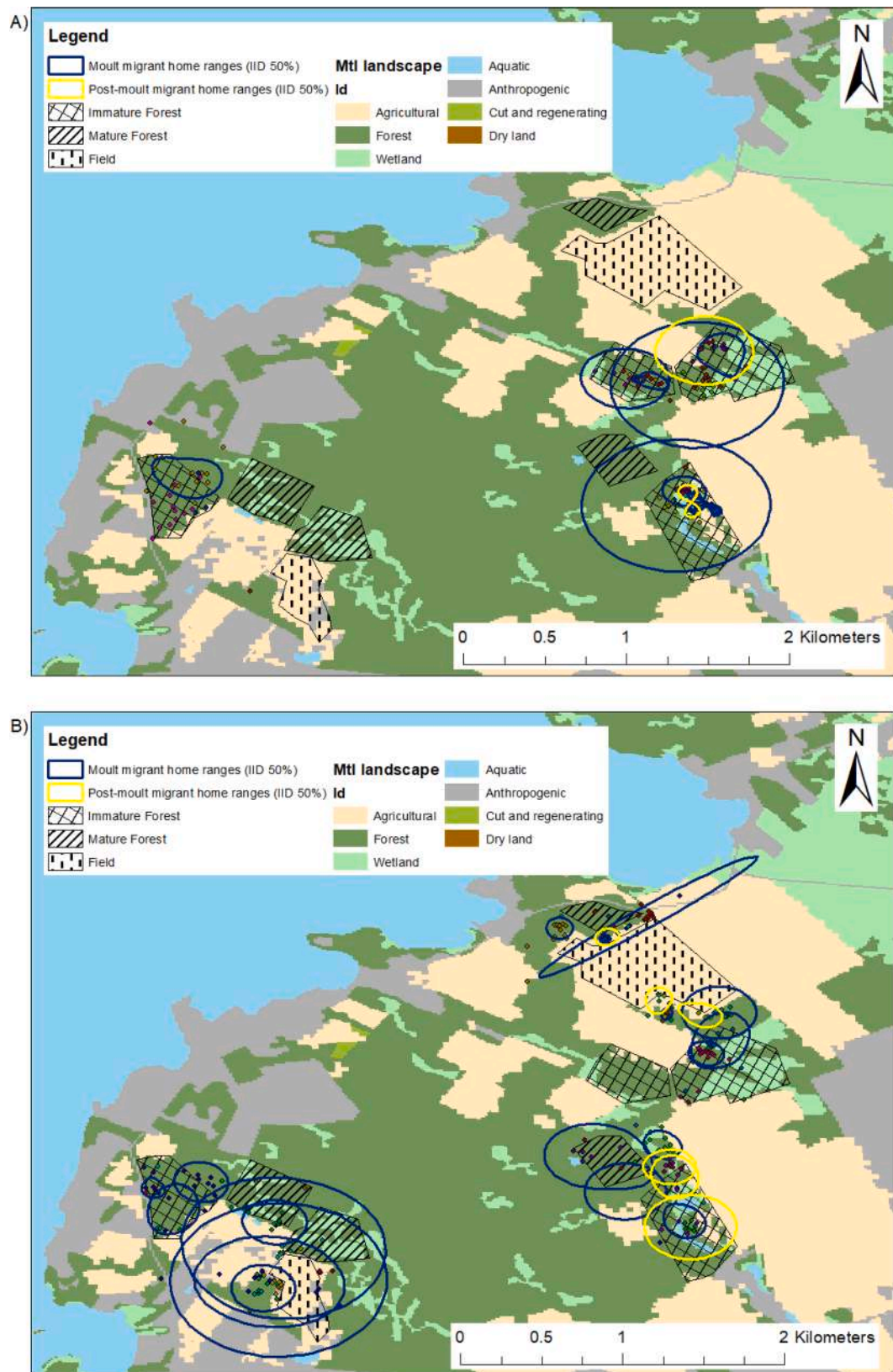
Fig. 2. Maps and habitat composition of the 50% independent and identically distributed (IID) isotropic calculated stopover home ranges of moult migrating (in navy blue) and post-moult migrant (in yellow) Swainson's Thrushes during their autumnal stopover in the West Island of Montreal. (A) 14 moult and 2 post-moult migrants who were translocated to immature forest sites and (B) 17 moult and 5 post-moult migrants who were translocated to mature forests or field sites. Bar plot C) shows the habitat types (% average) within the stopover home ranges of the moult and post-moult migrants. Average stopover home range size for moult migrants was 11.68 ha (standard deviation = 18.85 ha) and 5.92 ha (standard deviation = 5.33 ha) for post-moult migrants. GPS points on the maps were taken through manually tracking using radio telemetry when signal strength was at least 130 dB at a gain (precision) between 9 dB and 40 dB. Points of the same color belong to the same bird. (For interpretation of the references to color in this figure legend, the reader is referred to the web version of this article.)